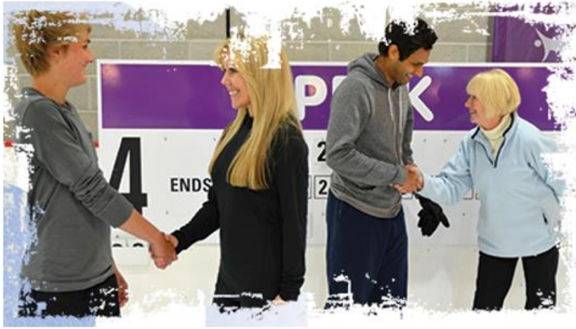
Content courtesy of the Royal Caledonian Curling Club